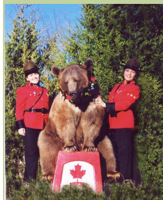
Bear Mountain Grizzly Bear Show

Lots to see and do if you like Native American culture and animals