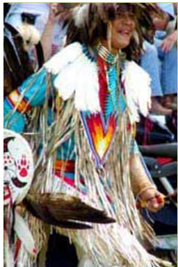
Traditional Seneca Displays and Presentations