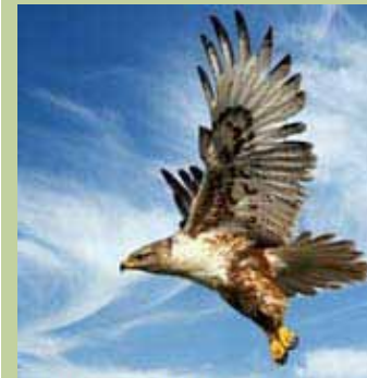
Eagle Dream Birds Of Prey

Phone: 814-968-9144 wildwoodsanimalpark.com